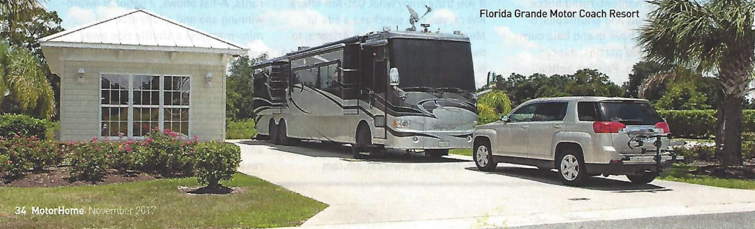
Florida Grande Motor Coach Resort