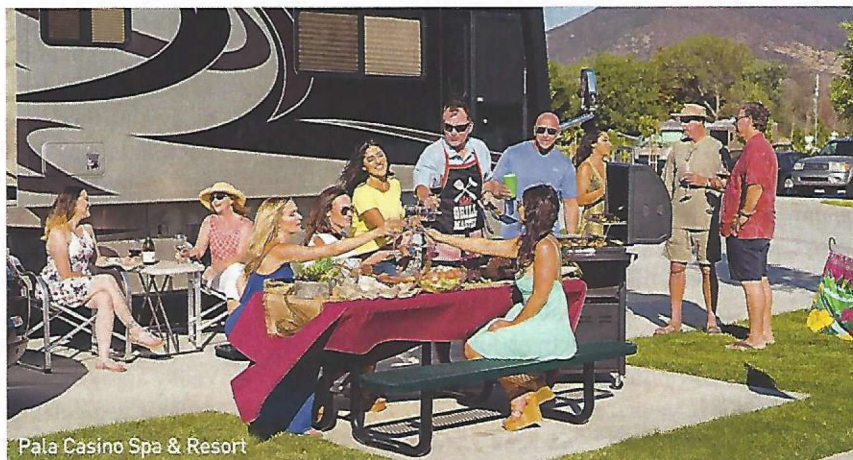
Pala Casino Spa & Resort