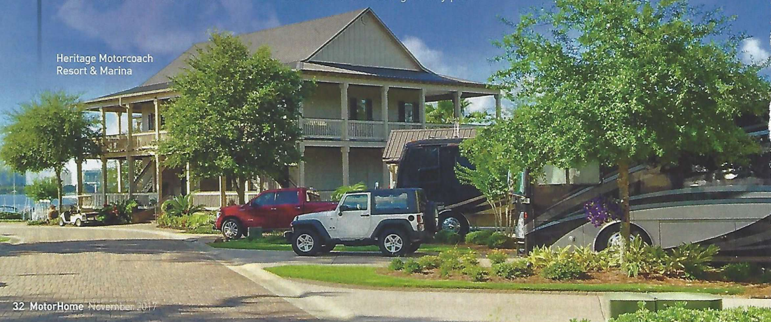
Heritage Motorcoach Resort & Marina

looking out over the water," said Willard. Once a visitor books an RV site (access to the coach houses or casitas not included), they are free to enjoy the resort, which includes a grand room with dual big-screen TVs and fireplaces, a fitness center and laundry facility, a dog-friendly private beach and a pavilion on the marina